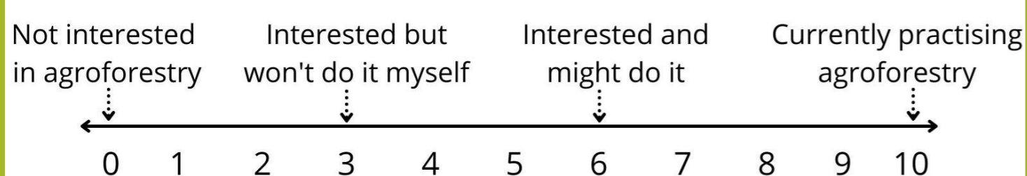
Fig 2: Agroforestry interest scale