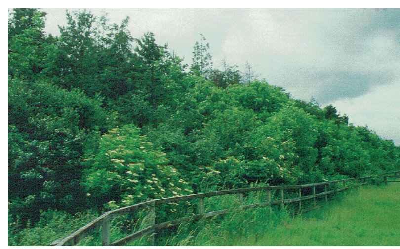
Figure 1. A shelterbelt with a sloping profile. (Photo: J. Davis).

Anecdotally, however, shelterbelts are an excellent way for farmers and landowners to start their journey into