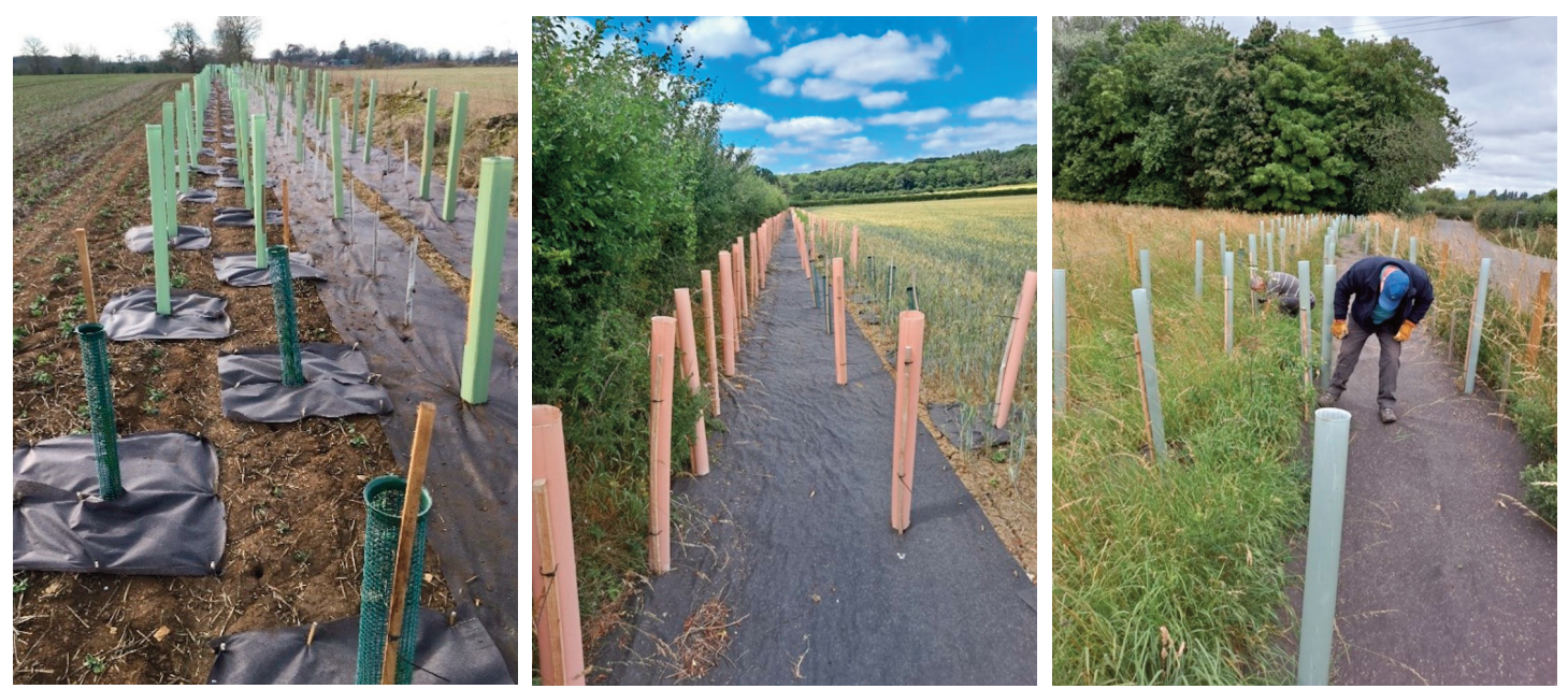
Figure 6. Various tree shelters and weed matting used as tree protection.

Planting in or against an existing hedgerow is less straightforward than traditional tree planting on farmland. From these experiences the project team are developing reasonable time planting standards and guarding parameters, which will be published in due course.